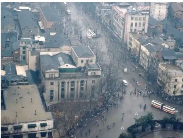
Nanjing in the 1980s, a period of economic transition when everyday life remained tightly structured by state institutions and work units.

Poverty had forced me out of school at sixteen and into a factory that produced intercontinental missiles capable of reaching North America. The factory was, in many ways, a miniature communist state. We lived in identical apartment blocks, attended endless political meetings and were forbidden from wearing lipstick or flared trousers.